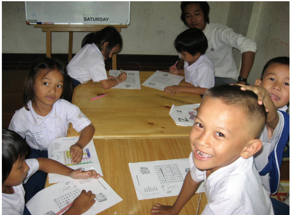
(Children Learning Center, Chiang Mai, n.d.).

B urma, which is also known as Myanmar, has eight major ethnic groups and more than one hundred smaller ethnic groups, and most have their own culture, traditions and language. The ongoing educational, economic and social crises in the country have forced people to flee and settle in neighboring countries, where most live and work illegally. Only about 10% of the children of the Burmese migrants in the region of Chiang Mai, Thailand, are legally entitled to live there and therefore have access to education. To begin to meet the need for education for the other, "illegal" Burmese migrant children, the Children's Learning Center was started in April 2008 with 30 students. By the end of that year it had expanded to accommodate a total of 130 students at two locations. Students 2 - 5 years old attend pre-school, 5 - 7 year olds attend Grade 1, and those age 7 - 12 attend Grade 2. Tuition and textbooks are free; uniforms are not necessary.